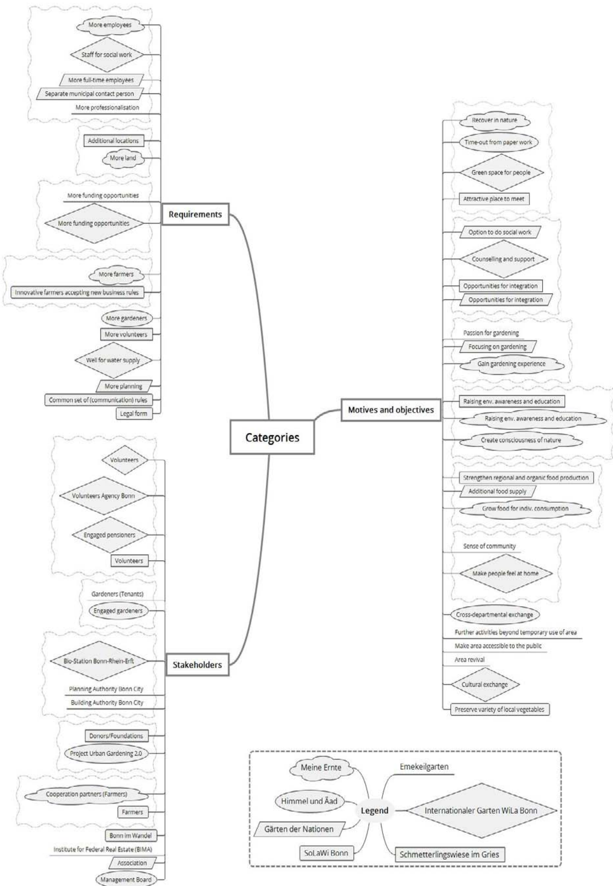
Figure 1: Analysis of the guided interviews (Mind-Map)